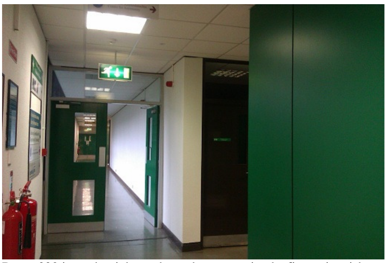
Room 220 is on the right as shown here opposite the fire extinguishers