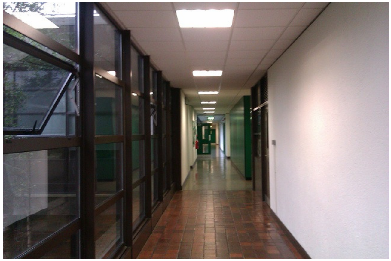
Continue to proceed down the corridor